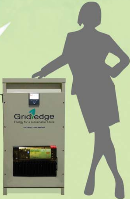
QUANTUM "plug and play"

the Australian and New Zealand distributor for the FIAMM SoNick battery